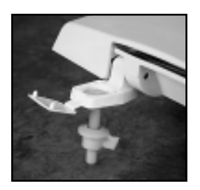
TOP-TITE<sup>®</sup> HINGES WITH BOLT AND WING NUT