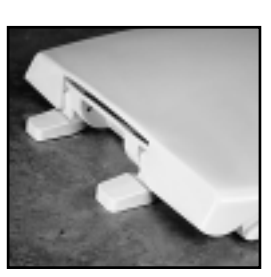
"LOCKED-IN" TOP-TITE<sup>®</sup> HINGE

Ring thickness is 3/4" Ring thickness including the bumper is 13/16" Height of the seat with cover is 2-3/16"