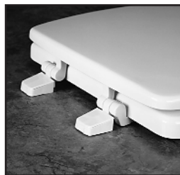
“LOCKED-IN” TOP-TITE® HINGE

Ring thickness is 3/4" Ring thickness including the bumper is 1-1/16" Height of the seat with cover is 2-5/16"