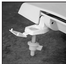
TOP-TITE® HINGES WITH BOLT AND WING NUT