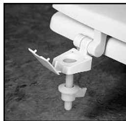
TOP-TITE® HINGES WITH BOLT AND WING NUT