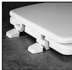
LOCKED-IN TOP-TITE® HINGE

Ring thickness is 13/16" Ring thickness including the bumper is 1" Height of the seat with cover is 2-1/2"