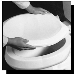
LIFT-OFF™ FOR EASY CLEANING FEATURE