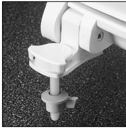
ONE HINGE TWO FEATURES

Seats shall be No. 300SLOW as manufactured by Church Seats. Seats shall be heavy weight and injection molded of solid plastic. Seats shall be closed front with cover for regular bowl and feature large molded-in bumpers. Color matched hinges contain stainless steel pintles, non-corrosive top-tightening bolts, wing nuts, no-slip washers with Slow-Close™ and Lift-Off™ features. The “locked-in” hinge design prevents wobbling. The molded-in bumpers provide easy cleaning. Color to be _____ . (Specify white or fixture manufacturer’s color.)