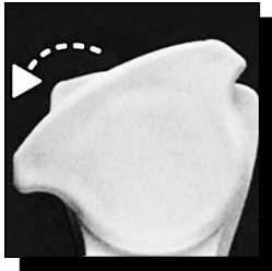
TWIST HINGE TO RELEASE SEAT

Ring thickness is 5/8" Ring thickness including the bumper is 7/8" Height of the seat with cover is 2 7/16"