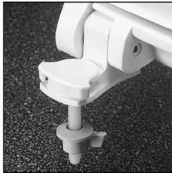
ONE HINGE TWO FEATURES

Seats shall be No. 380SLOW as manufactured by Church Seats. Seats shall be heavy weight and injection molded of solid plastic. Seats shall be closed front with cover for elongated bowl and feature large molded-in bumpers. Color matched hinges contain stainless steel pintles, non-corrosive top-tightening bolts, wing nuts, no-slip washers with Slow-Close™ and Lift-Off™ features. The “locked-in” hinge design prevents wobbling. The molded-in bumpers provide easy cleaning. Color to be _____. (Specify white or fixture manufacturer’s color.)