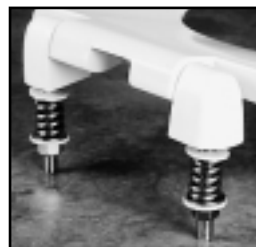
EXTERNAL CHECK HINGE

Ring thickness is 3/4" Ring thickness including the bumper is 1" Height of the seat is 1-1/2"