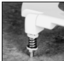
SELF-SUSTAINING AND EXTERNAL CHECK HINGES WITH 300 SERIES STAINLESS STEEL POST