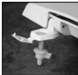
TOP-TITE® HINGES WITH BOLT AND WING NUT