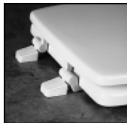
LOCKED-IN TOP-TITE® HINGE

Ring thickness is \frac{13}{16} " Ring thickness including the bumper is 1\text{-}\frac{1}{16} " Height of the seat with cover is 2\text{-}\frac{5}{16} "