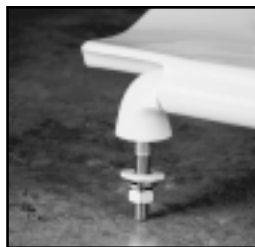
EXTERNAL CHECK HINGES WITH 300 SERIES STAINLESS STEEL POST