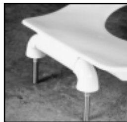
EXTERNAL CHECK HINGE

Ring thickness is 13/16" Ring thickness including the bumper is 1-1/4"